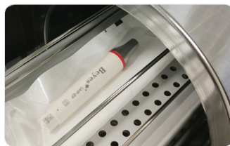
Autoclavable up to 135°C