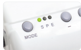
3 Modes: scaling, perio, endo