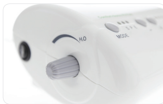
Built-in water regulation