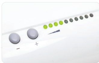
Powerful, with easy adjustable design

Boost your productivity and enhance patient experience with Comfort-Sonic®, the LED Piezo Scaler that is as versatile as your operational needs. It is compact and easy to use for a variety of daily applications including: scaling, endo and perio. Effortlessly eliminate calculus and other stubborn buildup with its ergonomic lightweight handpiece that features six LED lights encircling the tip for optimal illumination. The precise power delivered through steady linear ultrasonic vibrations ensures not only low operating noise, but also that movement is concentrated only at the tip, resulting in handpiece stability and maximized user comfort.