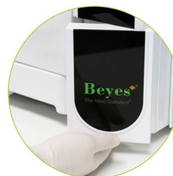
Double Hinge Door