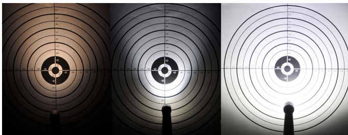
Fiber Optic Halogen Bulb

AirLight offers many advantages compared to the traditional fiber optic whether it has halogen or LED bulb. The light bulb of traditional fiber optic located on the tubing or the coupler. The light is then conducted by a fiber optic rod to the head of the handpiece. As a result, the intensity is reduced during the transition and the coverage is limited. Additionally, the fiber optic rod gets degraded over time with autoclaving, and your light becomes getting dimmer and yellowish. Eventually, you will have to replace the fiber optic rod.